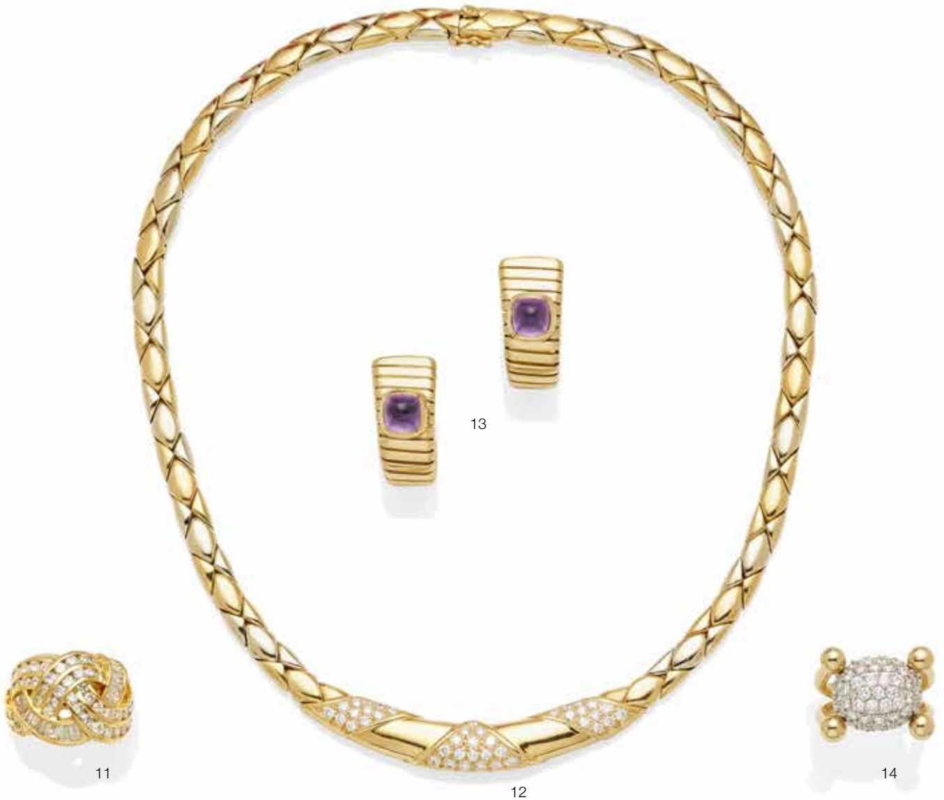
11 A DIAMOND AND 18K GOLD RING estimated total diamond weight: 4.00cts; size: 4